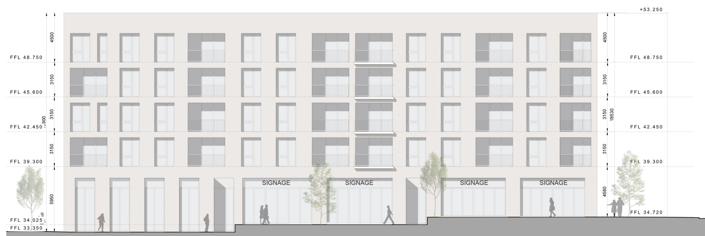
East Elevation - To Square