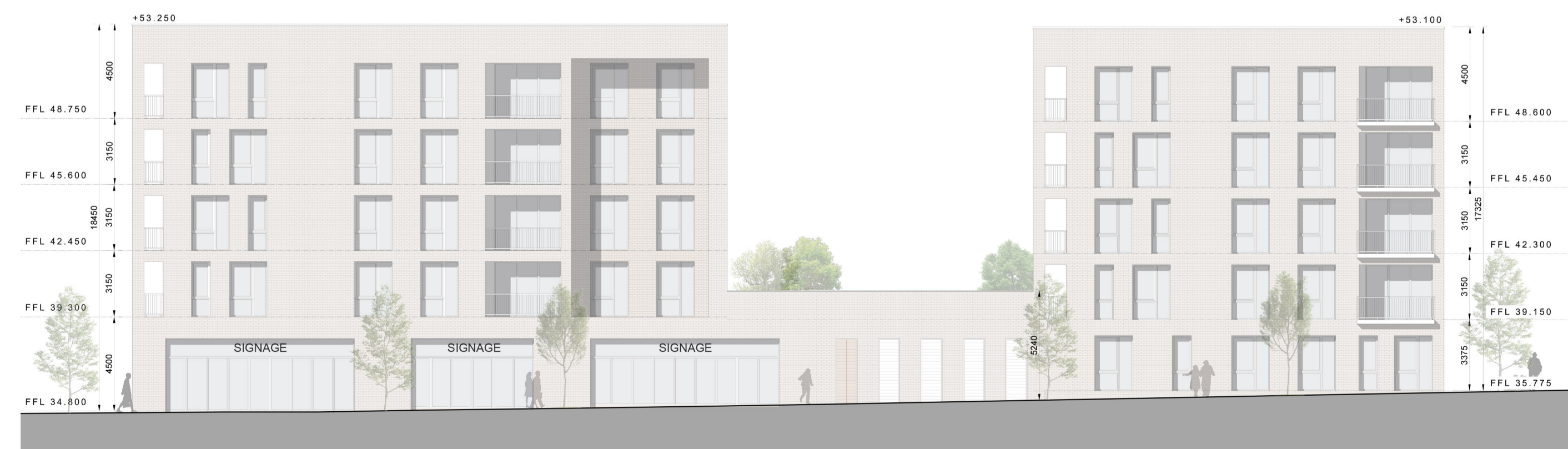
North Elevation - To Distributor Road