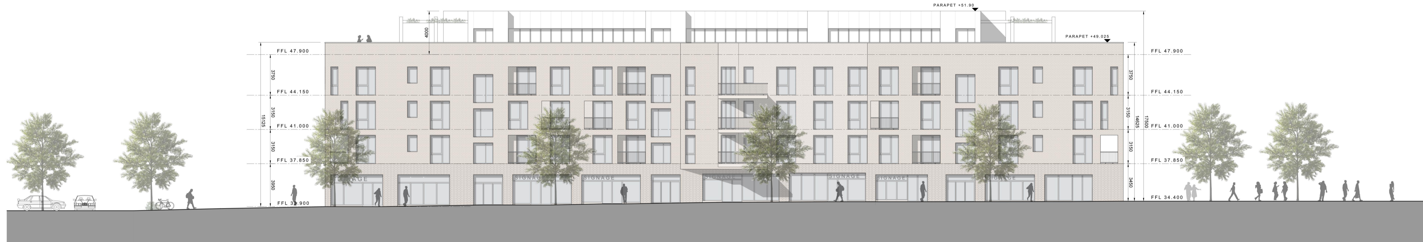
BLOCK D NORTH ELEVATION SCALE: 1:200