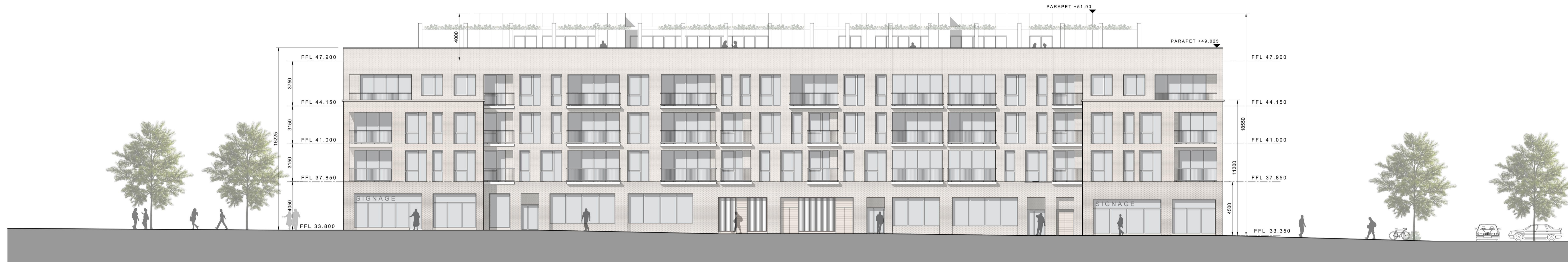
BLOCK D SOUTH ELEVATION SCALE: 1:200