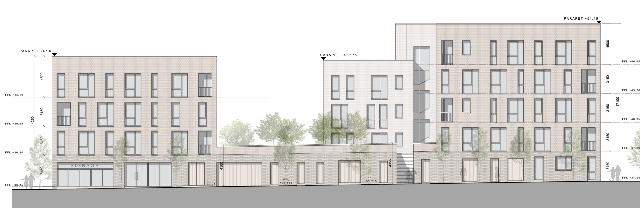
NORTH ELEVATION FACING ONTO BLOCK F