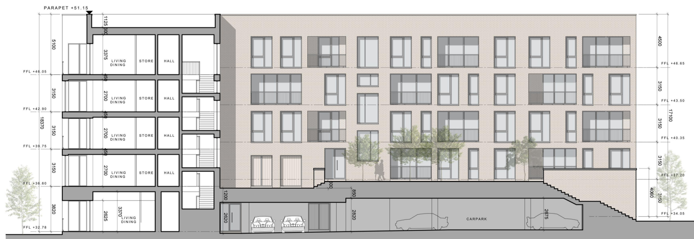
SECTION B-B EAST FACING PODIUM ELEVATION