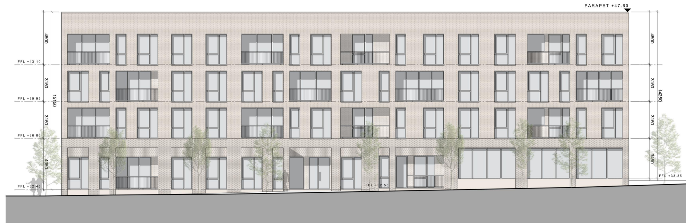
EAST ELEVATION FACING ONTO WALLED GARDEN