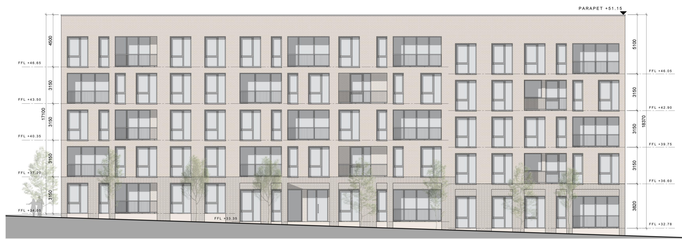
WEST ELEVATION FACING ONTO NORTH SOUTH ROAD