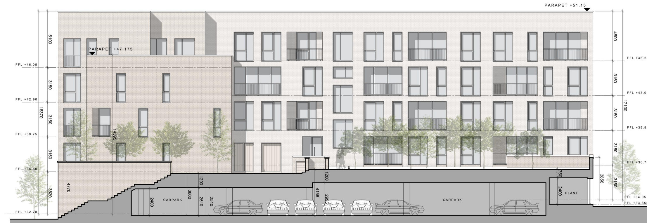
SECTION C-C EAST FACING PODIUM ELEVATION