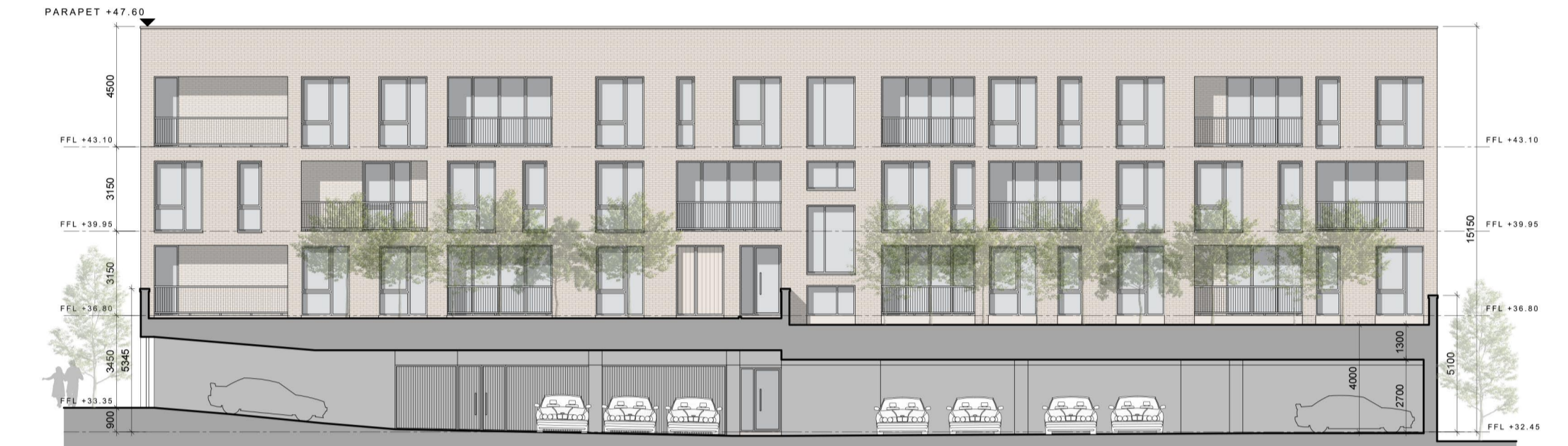
SECTION A-A WEST FACING PODIUM ELEVATION