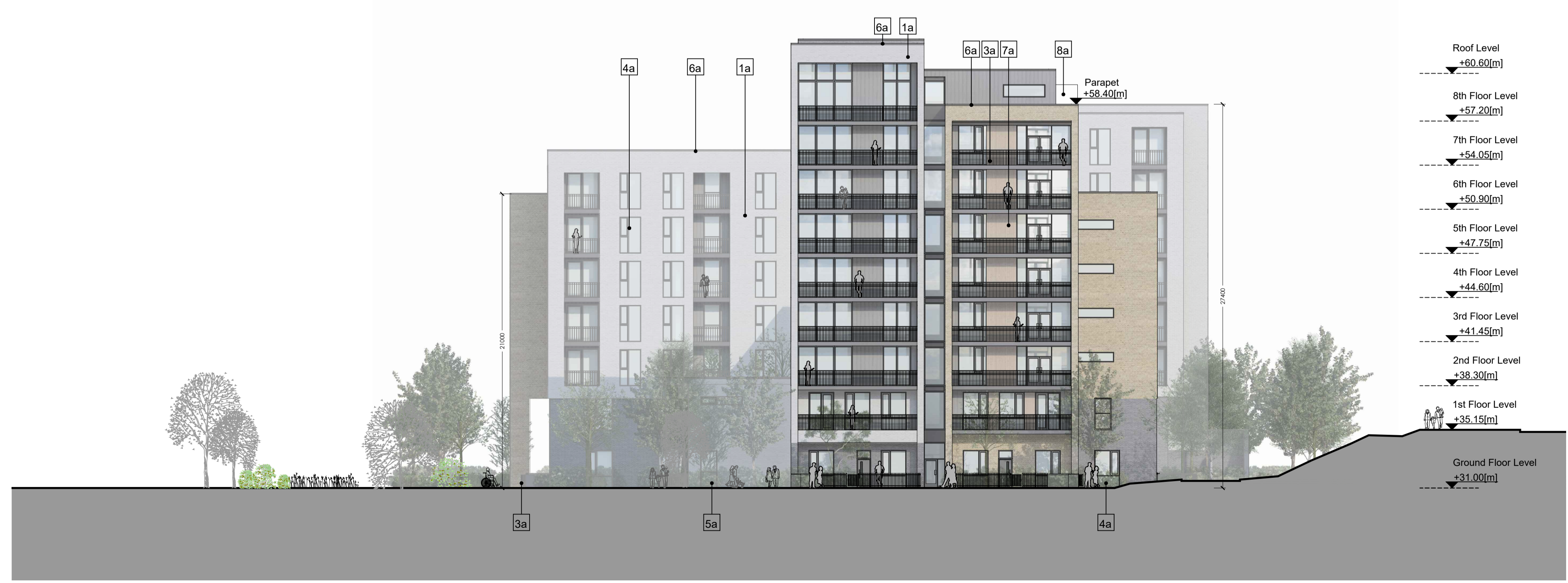
West Elevation - Block 6 Scale 1:200 @A1