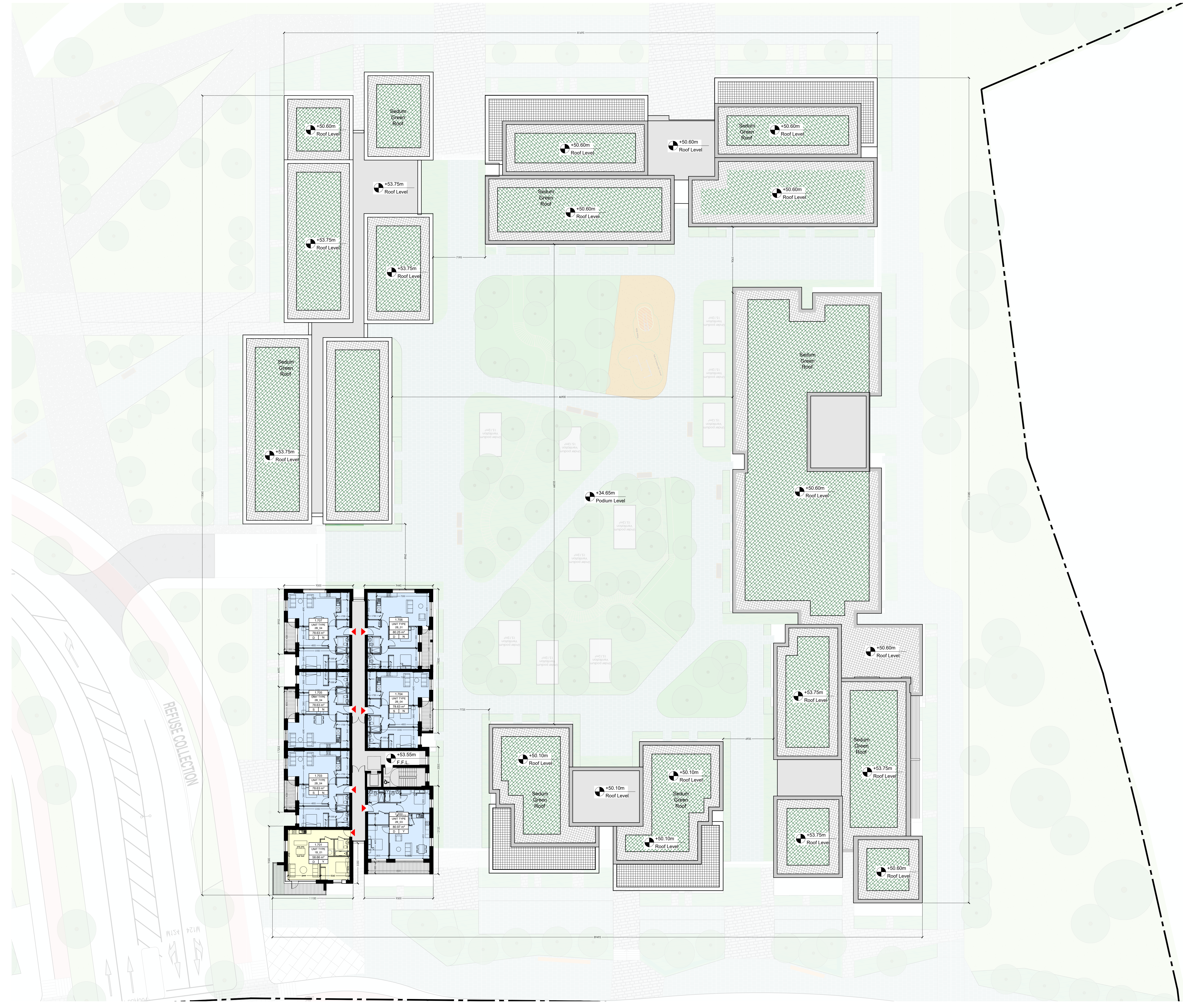
7th Floor Plan - Block 1 Scale 1:200 @A0

Note: Refer to Unit Type Drawings for further details on Unit Type Layouts and Areas.