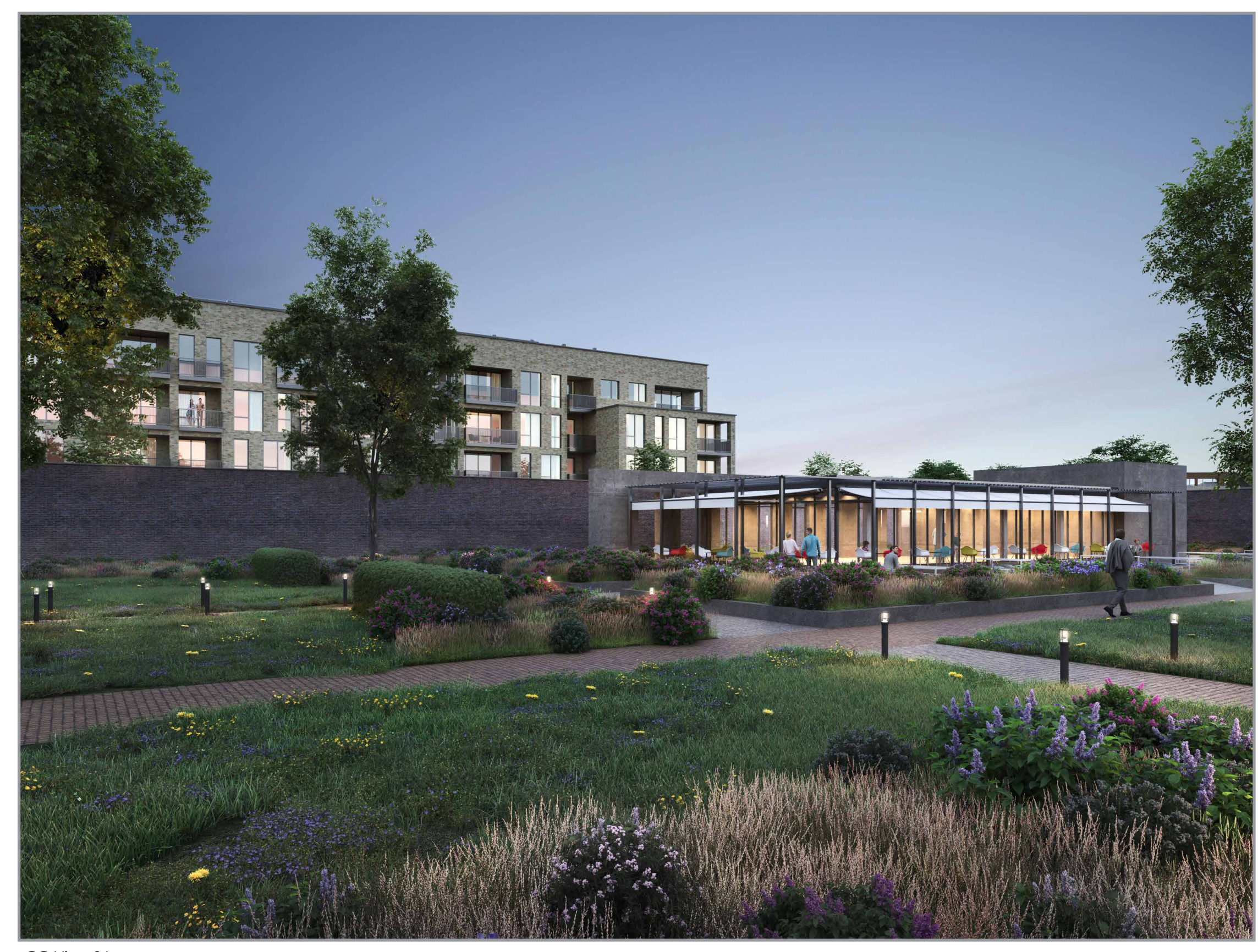
CG View 06