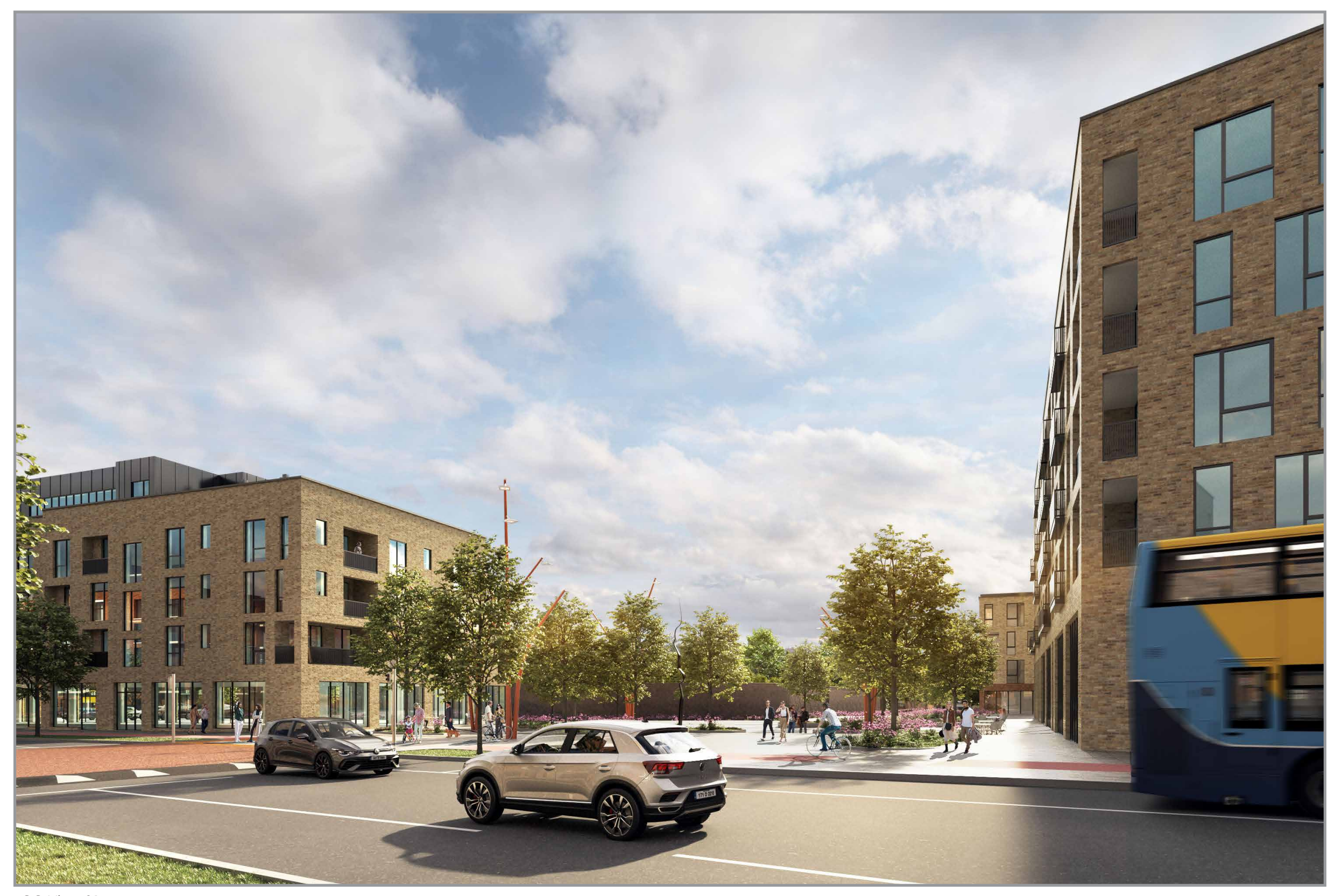
CG View 01