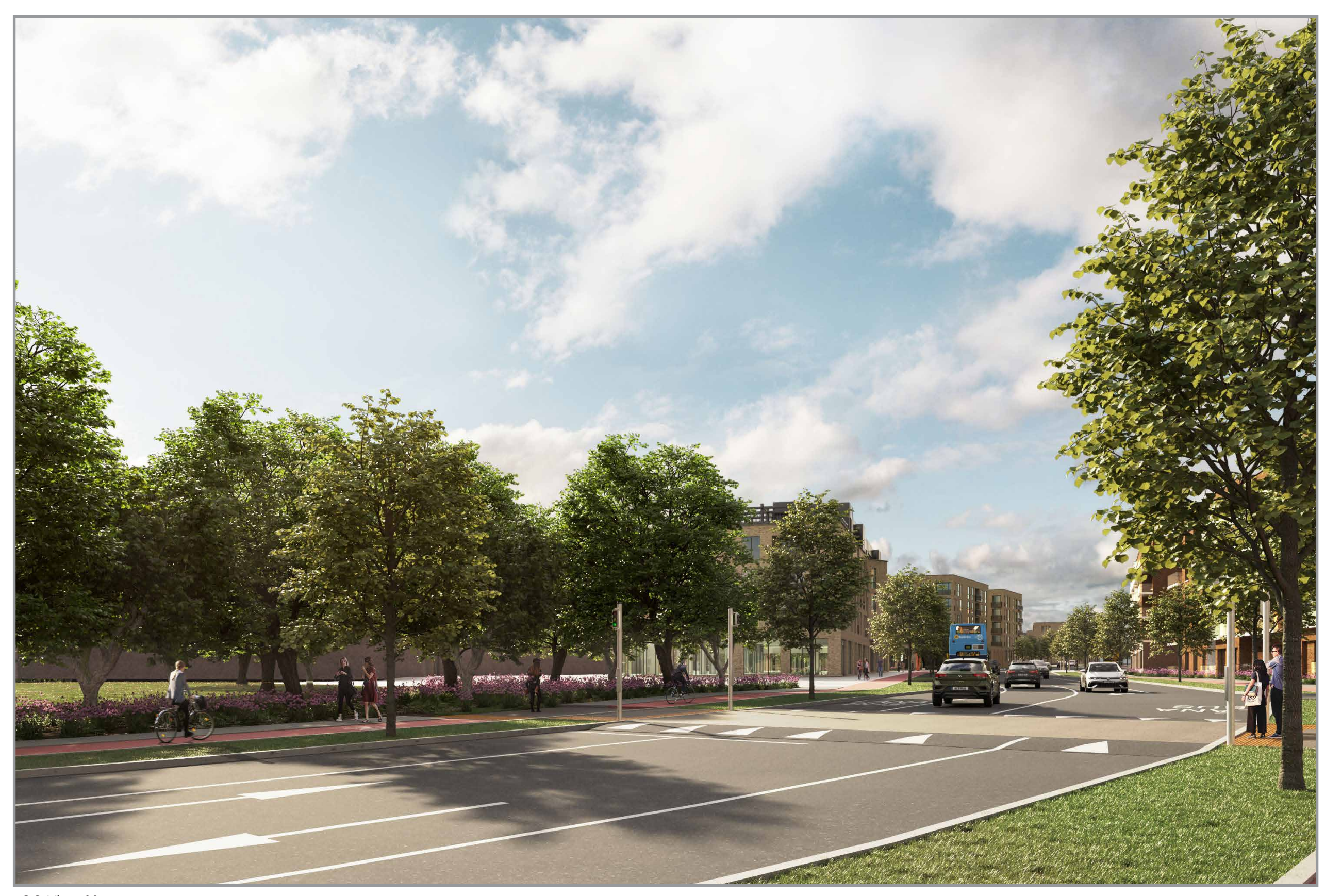
CG View 03