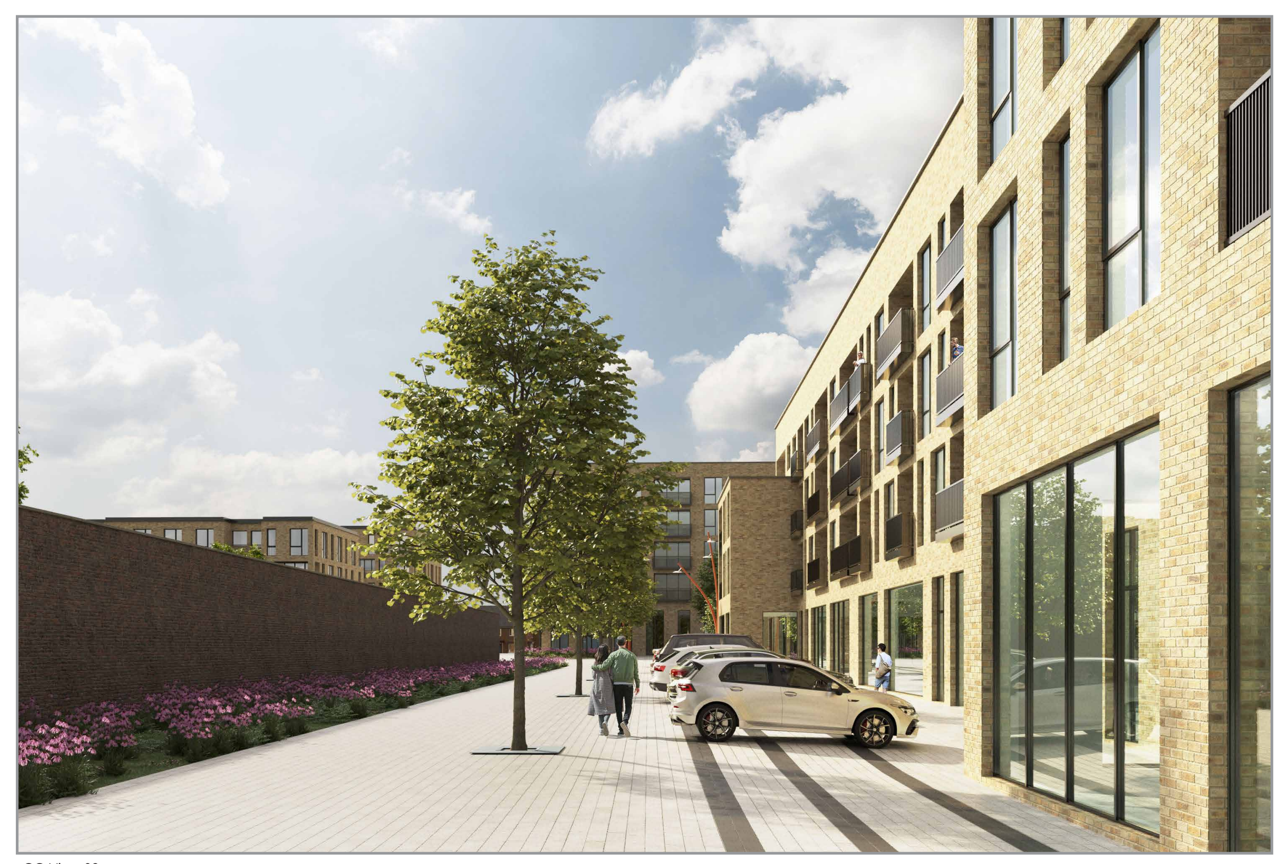
CG View 02