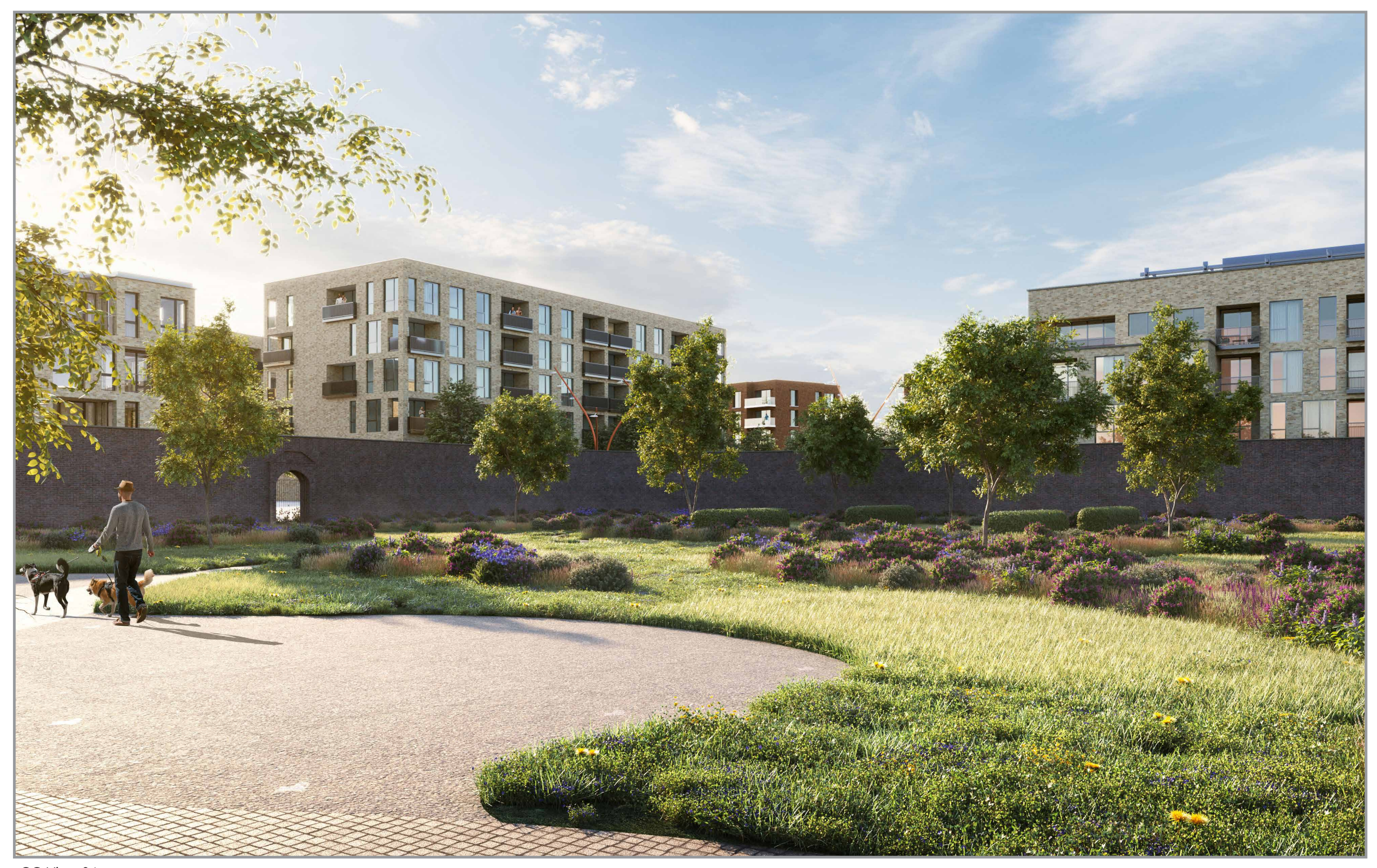
CG View 04