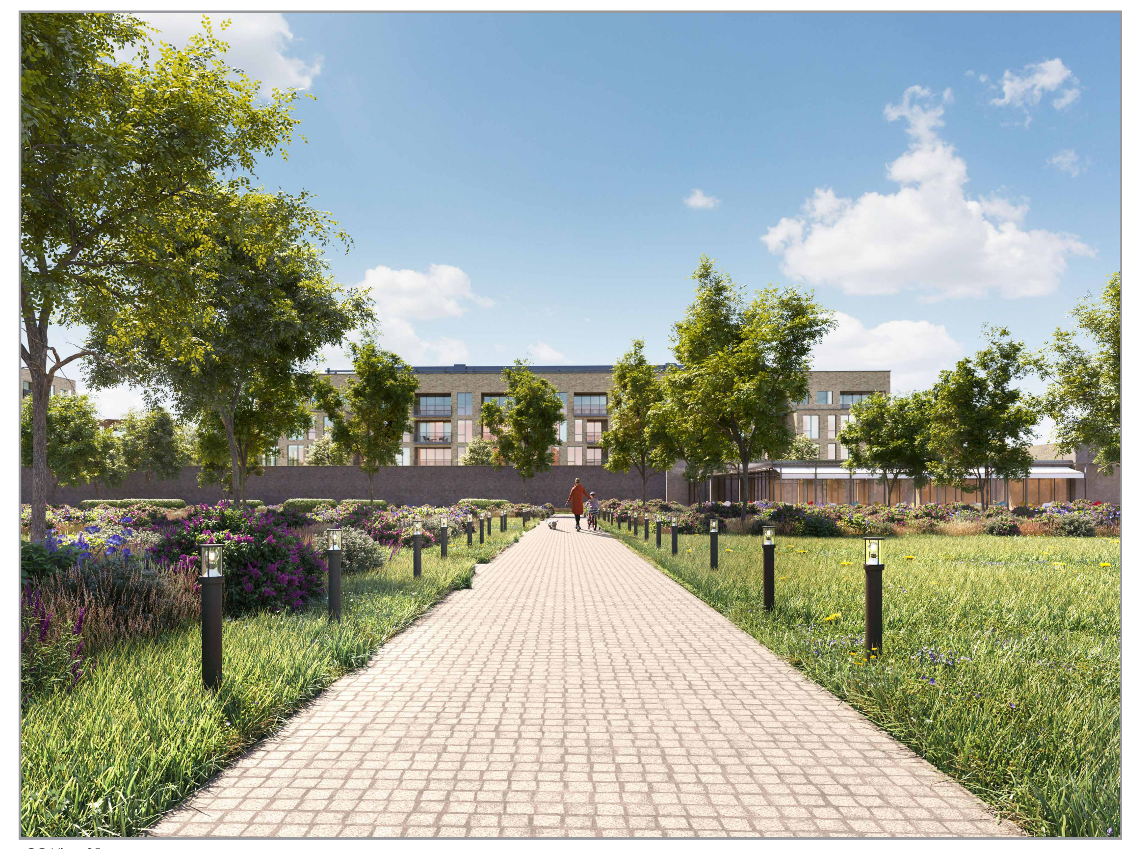
CG View 05