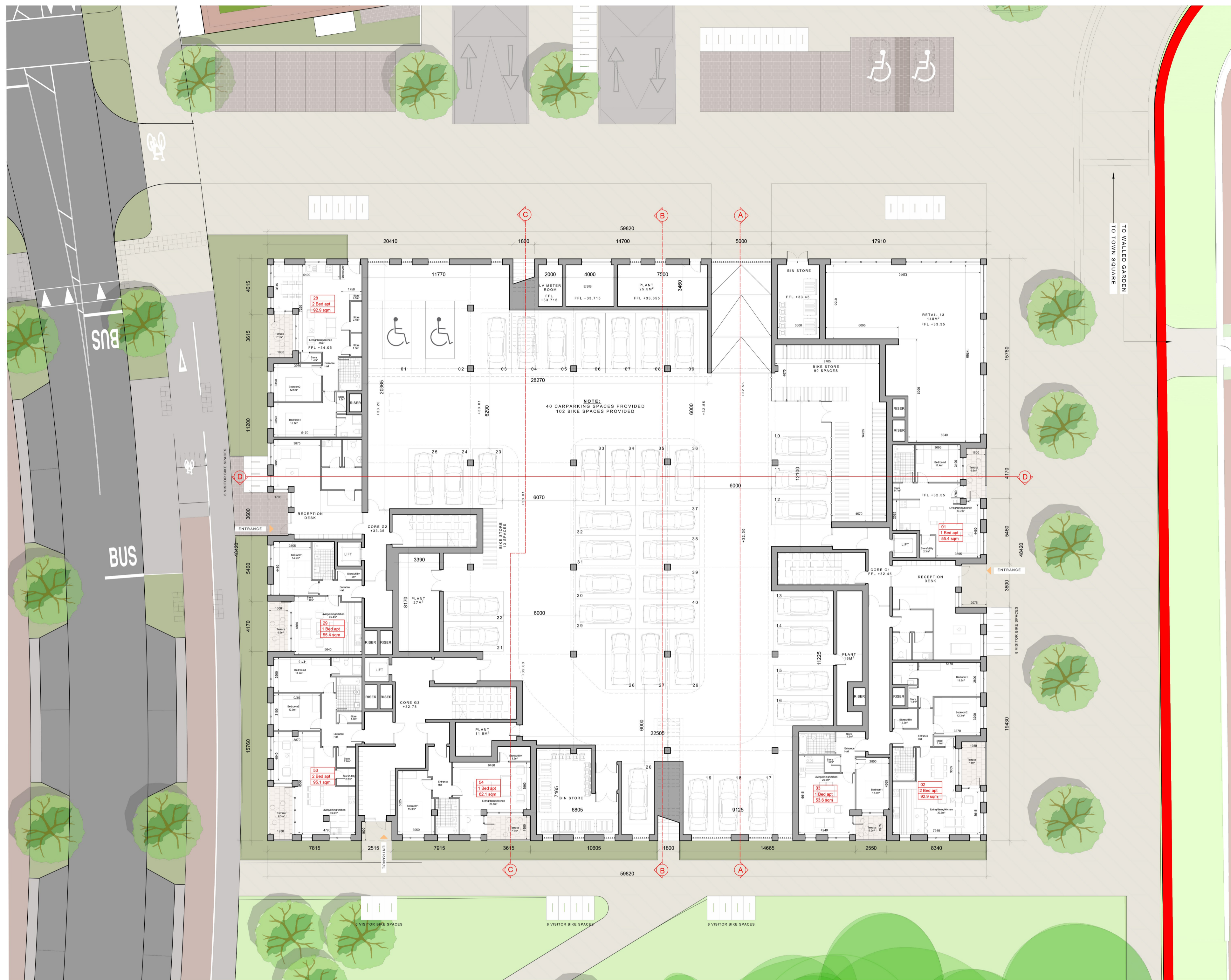
GROUND FLOOR PLAN IN CONTEXT

SEE THE BIG SPACE LANDSCAPE ARCHITECTS DRAWINGS FOR DETAIL OF LANDSCAPE TREATMENT