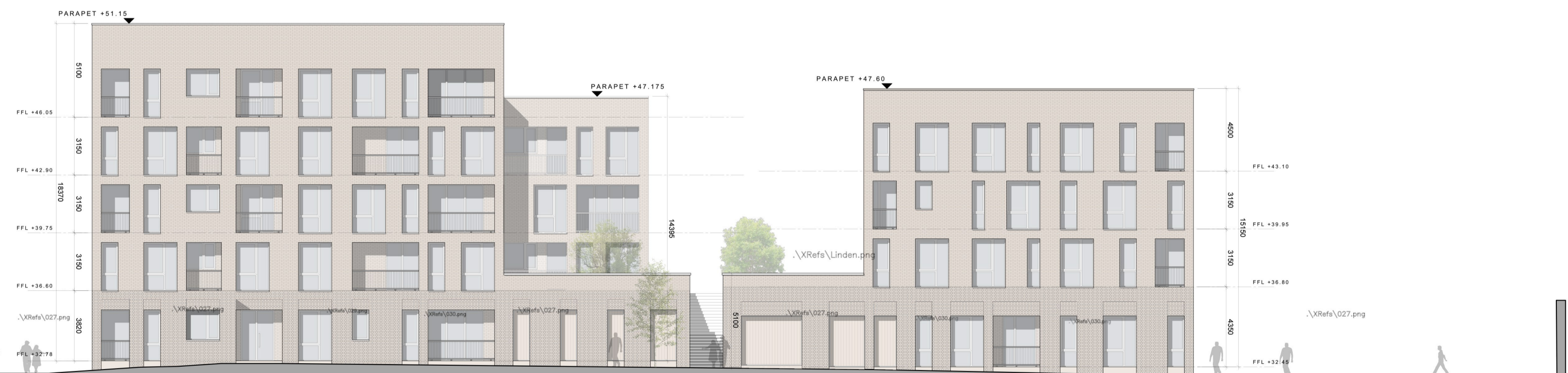
SOUTH ELEVATION FACING ONTO OPEN SPACE TO THE SOUTH

SEE THE BIG SPACE LANDSCAPE ARCHITECTS DRAWINGS FOR DETAIL OF LANDSCAPE TREATMENT