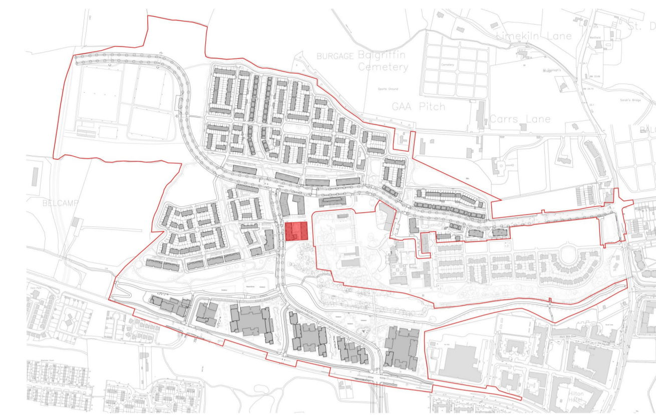
KEY PLAN INDICATING LOCATION OF BLOCK G NOT TO SCALE